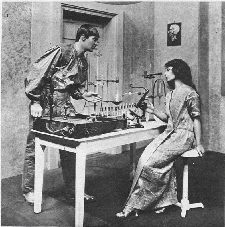
A NEW ADAM AND EVE: MR. IAN HUNTER AND MISS OLGA LINDO AS PRIMUS AND HELENA, THE PERFECTED ROBOTS DISCOVERING LOVE.

Helena Glory, who is in love with Harry Domain, general manager of Rossum's Universal Robots (synthetic machines in human form), cannot believe that Sulla, his Robotess typist, is not a real girl. There is also a Robotess called Helena, and a young Robot named Primus. They are such perfect specimens that eventually they develop emotions and fall in